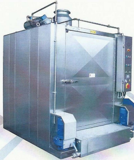
Rotary Jet 1000