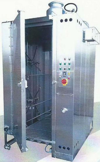
Rotary Jet 750